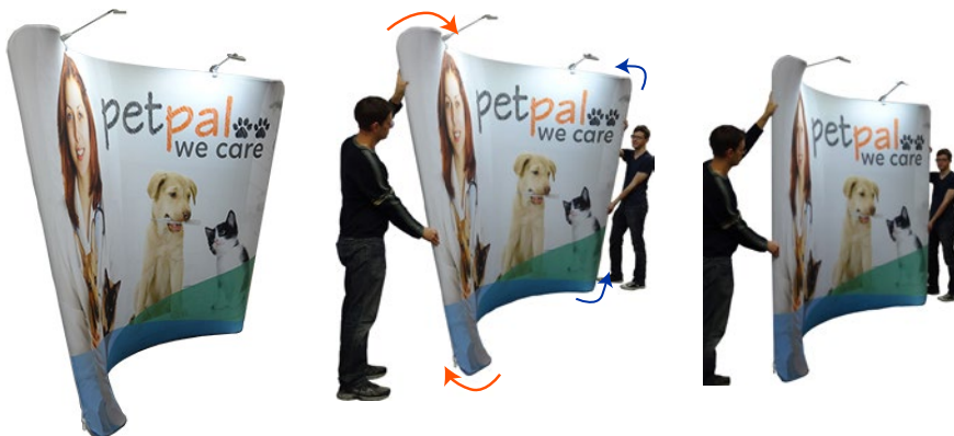
9. Straighten the frame. Have two people hold the sides of the frame, then gently twist until the frame is straight.