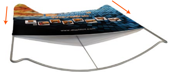
3. Pull the pillowcased graphic over the frame. Do not zip until after center pole is installed.