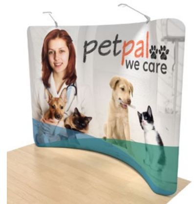
8. Stand the display up and move into desired position.