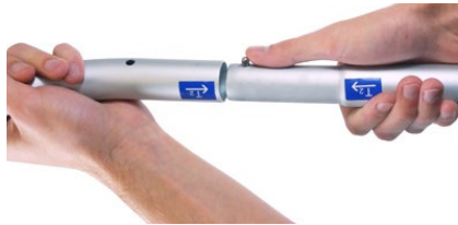
2. Connect large bungied poles to corners, matching up stickers.