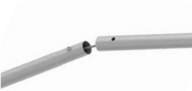
1. Assemble bungeed poles.

Note: Assembly is the same for all sizes of curved Helium displays