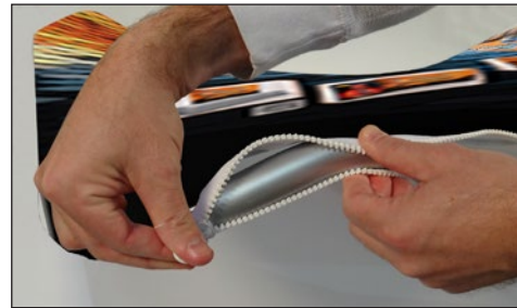
5. Zip up the bottom of the graphic.