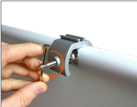
6. Attach optional light clamps to the top bar in desired locations.

Tip: It is easier to do this before standing the display up.